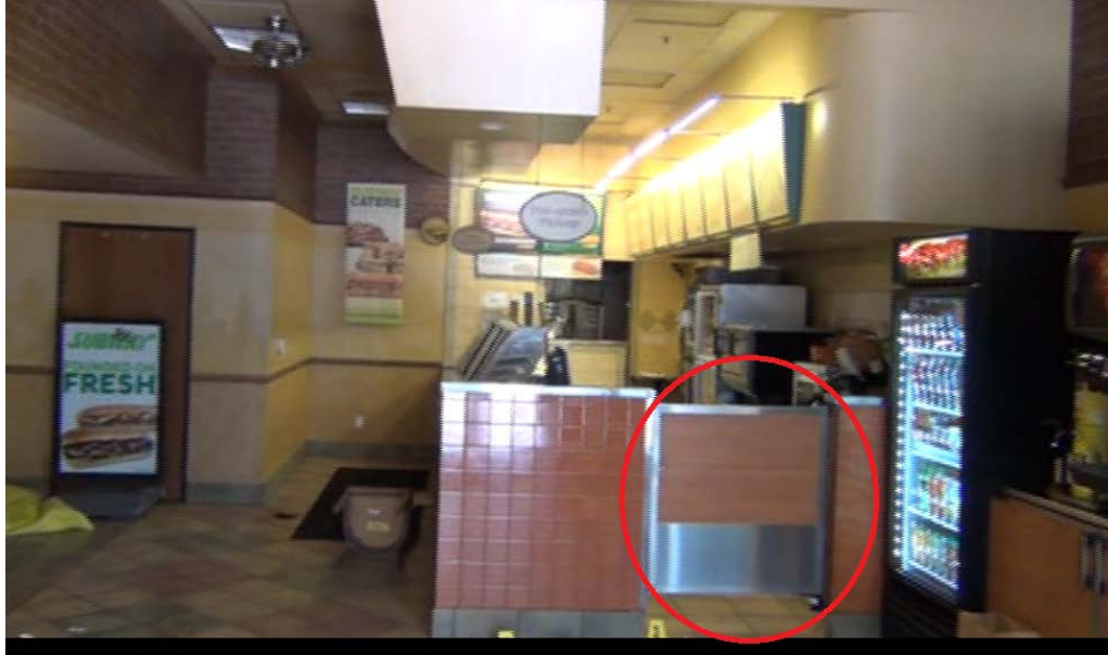
Fig.1b: Interior of the restaurant from the entrance. The counter is in the center, with the customer-side on the left and the employee-side on the right. The red circle denotes a swinging half-door that leads to the employee area.

The surveillance video system shows Flusche entered the restaurant at around 11:10 a.m. to order a sandwich. Once it was made, Flusche said he had no money and demanded the sandwich for free. The employee refused and placed the sandwich on the back counter. Flusche continued to linger in the restaurant for approximately ten minutes, during which time other customers filtered in and out. Flusche attempted to unlock the swinging door that led to the employee area behind the counter, but the employee pushed him away and told him he was trespassing. The employee then closed and latched the door.