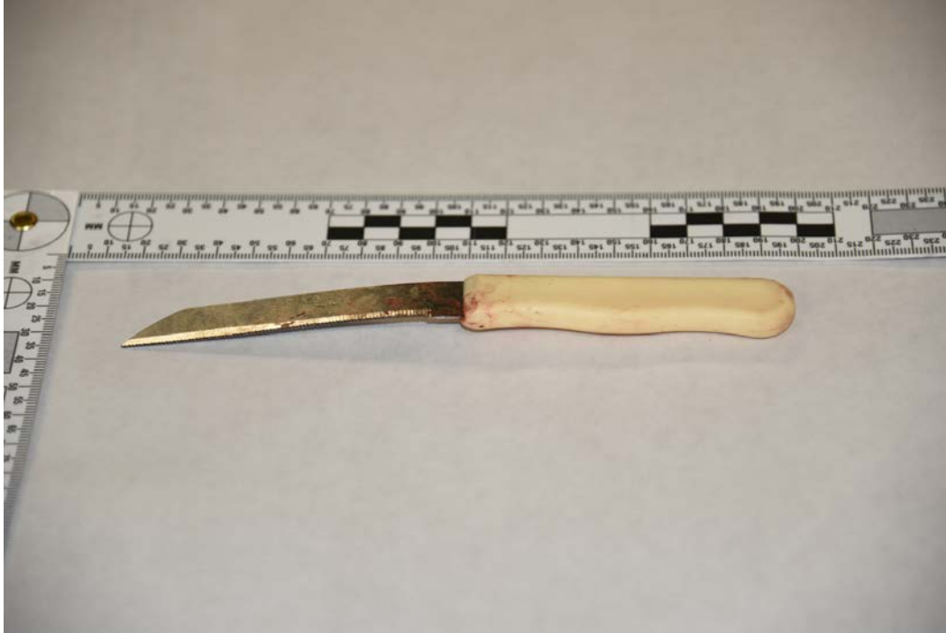
Fig. 2: The knife recovered at the scene by SFPD.

Several civilians attempted to intervene and stop Flusche's attack of the employee. Three women were present in the restaurant when it began, and all of them attempted to aid the employee in some manner. One woman, who said she feared Flusche was going to kill the employee, entered the back area almost immediately, where she hit and kicked Flusche. She later grabbed a Subway oven paddle and repeatedly hit Flusche with it. None of her actions appeared to affect Flusche. The other two women, who worked with each other, reported that they yelled at Flusche to stop. One of them said she dialed 9-1-1 but her call was directed to a recording. The two coworkers left the restaurant to look for help. The surveillance video shows that an African-American man and a young African-American man with a backpack enter the restaurant mid-assault, and both of them threw objects at Flusche. Flusche appeared to ignore them, too, and continued to strike the employee.