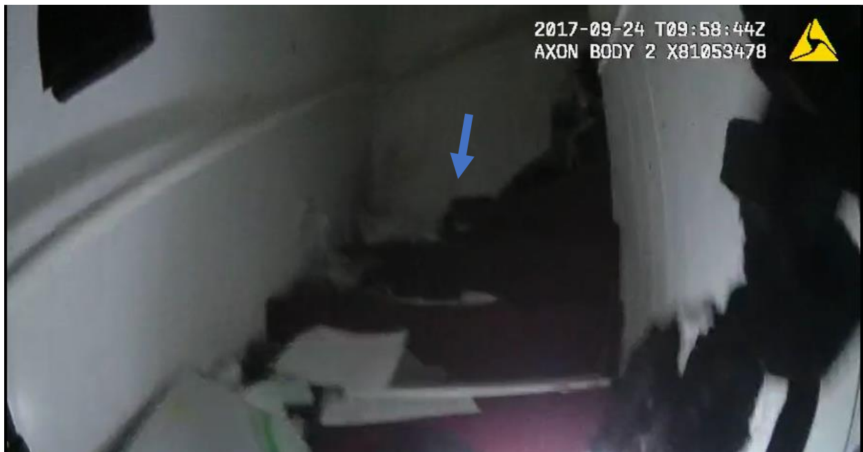
Figure 3 -- The stairwell just beyond the makeshift furniture barricade. The arrow shows where approximately where Ofc. Suslow stood looking up (to the reader's right) at the bedroom door when it opened and closed.