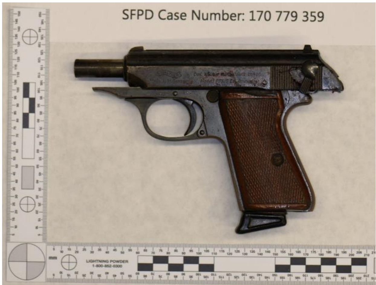
Figure 6 -- Walther PPK/S pistol found in the bedroom.